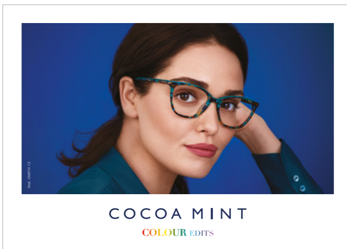
A4 Strut Card

Images shown for illustrative purposes. Merchandising available with frame purchases. Terms & Conditions apply.