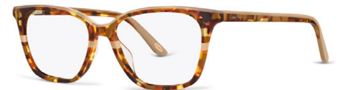
C1 Brown Marble/Taupe

Style 9109 is the chicest way to walk into winter. Injecting fresh energy into the colour blocking concept, the eyefront is a composite of four highly complementary acetate layers. Designed in an angular shape that will particularly flatter round and oval face shapes, the frame is complete with Italian branded flex hinges. C1 is an autumnal palette of copper, amber, taupe and maple tones. C2 is a scarlet marble with flashes of pink, bronze and ruby red.