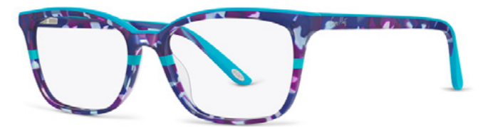
C2 Purple Marble/Teal