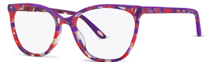
C1 Red Marble/Purple

Kickstarting the new season with show stopping colours and statement acetate is model 9110. Each frame is completely unique and guaranteed to elevate the everyday, complete with Italian branded flex hinges. The slightly rounded eye shape looks flattering on square faces. C1 is an unexpected colour pairing of ruby red and ultraviolet marble. C2 is limelight stealing teal tortoiseshell with tropical turquoise lamination.